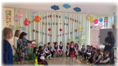
I Final concert