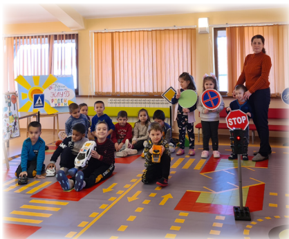
I am a pedestrian