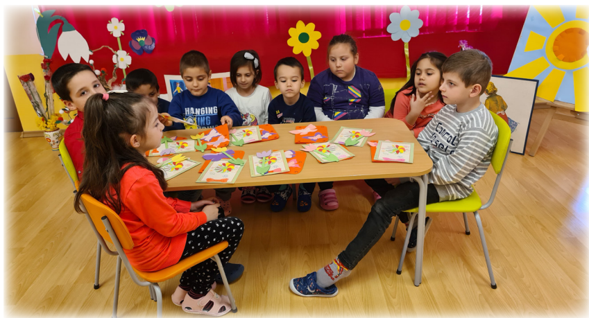
Gifts made for mom